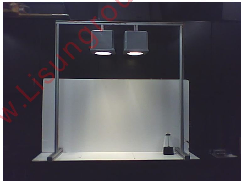
Figure 1. Photograph of test space in the present human factors study.

The illumination in the test space was provided by light-emitting diode (LED) lamps mounted above the horizontal surface of the test space. The horizontal illuminance in the center of the horizontal surface was 300 lx. The LED lamps were controlled by a custom driver that permitted operating the lamps at different frequencies and different amounts of modulation with rectangular temporal waveforms having a duty cycle of 50%. For this experiment, the amount of modulation was always set to 25% flicker, corresponding to a flicker index of 0.13. The frequency could be adjusted to 100, 200, 500 or 1000 Hz. Ten participants (age 28-52 years, mean 38 years) viewed each of the four conditions in a randomized order and answered the following questions: