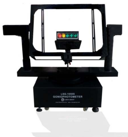
LSG-1950S Economic Version